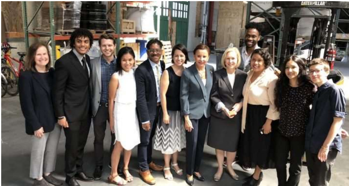
Senator Kirsten Gillibrand and congresswoman Nydia Velázquez with representatives from national and local groups who focus on supporting, organising, or developing worker co-ops

The apex body for US co-ops, NCBA Clusa ( http://www.ncba.coop ), said it was “thrilled” to see the act pass into law.